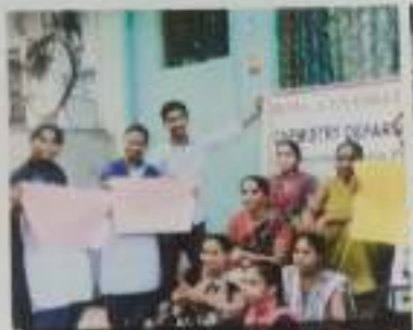
Visakhapatnam, Andhra Prade 22-29-16, Port Area, Visakhapatnam, Andhra 530020, India Lat 17.698948° Long 83.300328° 16/09/22 04:33 PM GMT +05:30