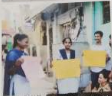
Visakhapatnam, Andhra Prade 22-29-16, Port Area, Visakhapatnam, Andhra 530020, India Lat 17.698972° Long 83.300335° 16/09/22 04:32 PM GMT +05:30