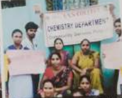
Visakhapatnam, Andhra Prade 22-29-16, Port Area, Visakhapatnam, Andhra 530020, India Lat 17.698954° Long 83.300311° 16/09/22 04:30 PM GMT +05:30