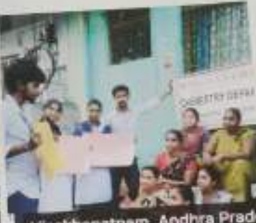
Visakhapatnam, Andhra Prade 22-29-16, Port Area, Visakhapatnam, Andhra 530020, India Lat 17.698966° Long 83.300328° 16/09/22 04:33 PM GMT +05:30